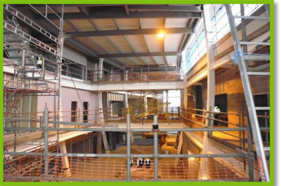
(External & internal photographs taken January 2015)