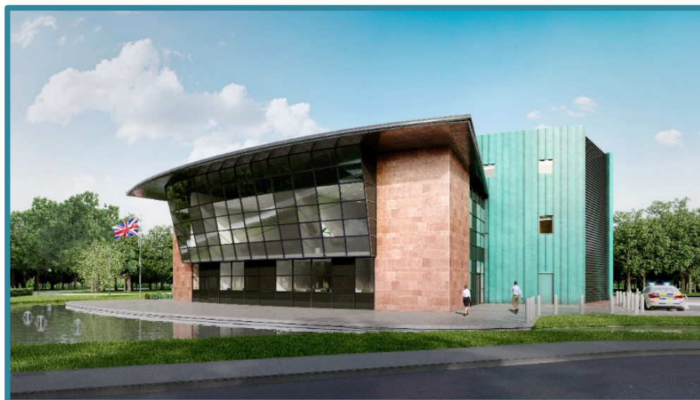
Construction on the Eden Deployment was completed in January 2020 (design image)