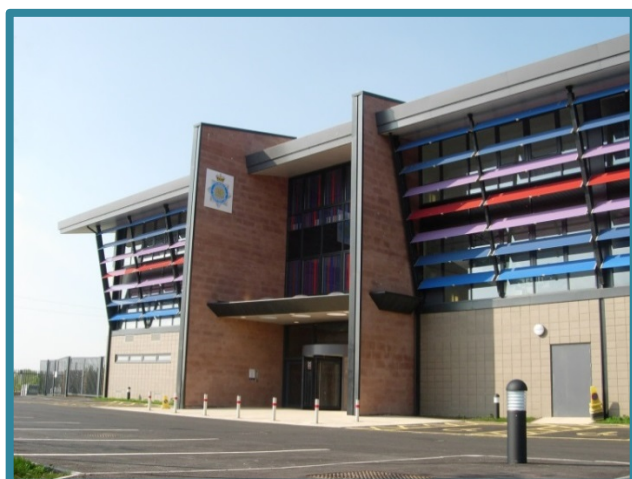
North Cumbria Territorial Policing Area HQ – Carlisle

There are two categories of leases: Operating leases are where the risks and rewards of ownership stay with the lessor and the annual rental charges are charged through the CI&ES Finance leases are where the risks and rewards of ownership are transferred to the lessee and where the assets are recognised on the balance sheet of the lessee.