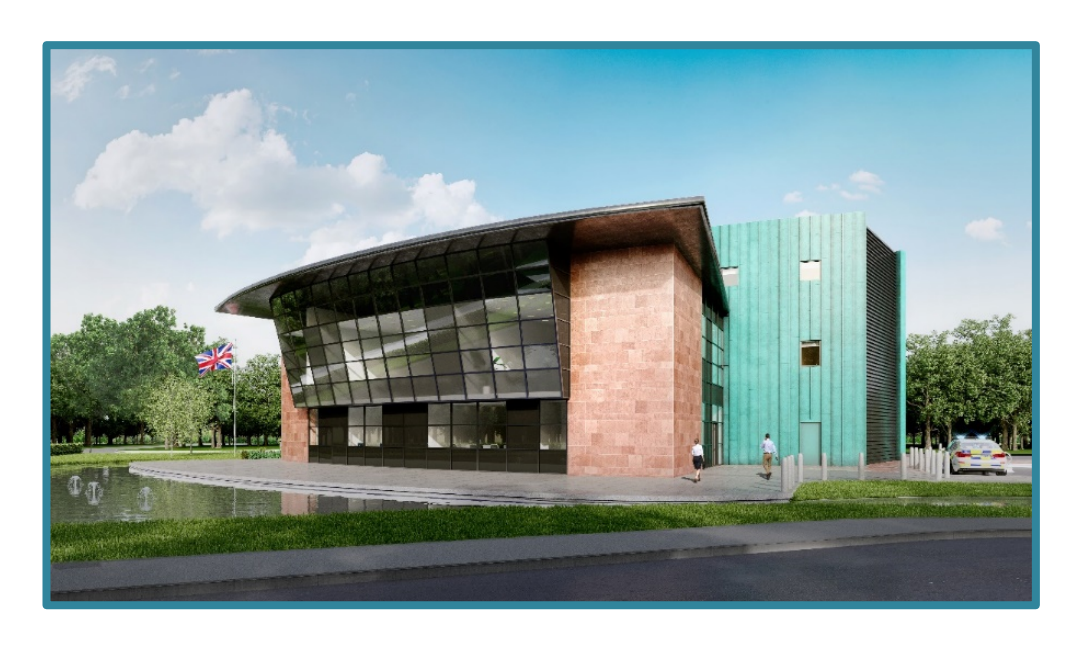
Construction on the Eden Deployment was completed in January 2020 (design image)